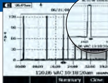
TrendCapture displays vDC logged date.